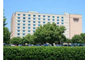
New District Officers and Board Installed at the 78th Annual NC District Exchange Club Convention June 22-23, 2012

The 78 th Annual District Convention was held in Embassy Suites, Cary, NC the third weekend in June. There were District and Foundation Meetings, the Youth and ACE Awards night that was covered by local news, One Nation Under God breakfast, a touching Memorial Service to honor those great Exchangites whom we have lost this year, and an election of the new district officers and board.