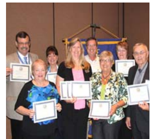
Club representatives and District Directors pose with National Service Awards

Exchange Clubs of South Granville, Hillsborough, Kernersville, Shelby, North Fayetteville, New Hope-Wilders Grove, Raleigh, North Raleigh, Swift Creek Township, Lower Cape Fear/Wilmington, Mooresville/Lake Norman